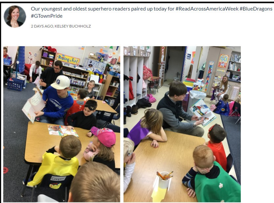
Seniors visited Kindergarten and 1st grade classes to read during the week as well.