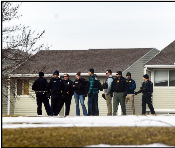
The unexpected tragedy surprised a quiet neighborhood in Sioux Falls this past weekend.

Police still do not have a suspect in the case. Officials said during Friday's daily police briefing that there was no other new information available from the homicide, including the results of a preliminary autopsy report conducted Thursday.