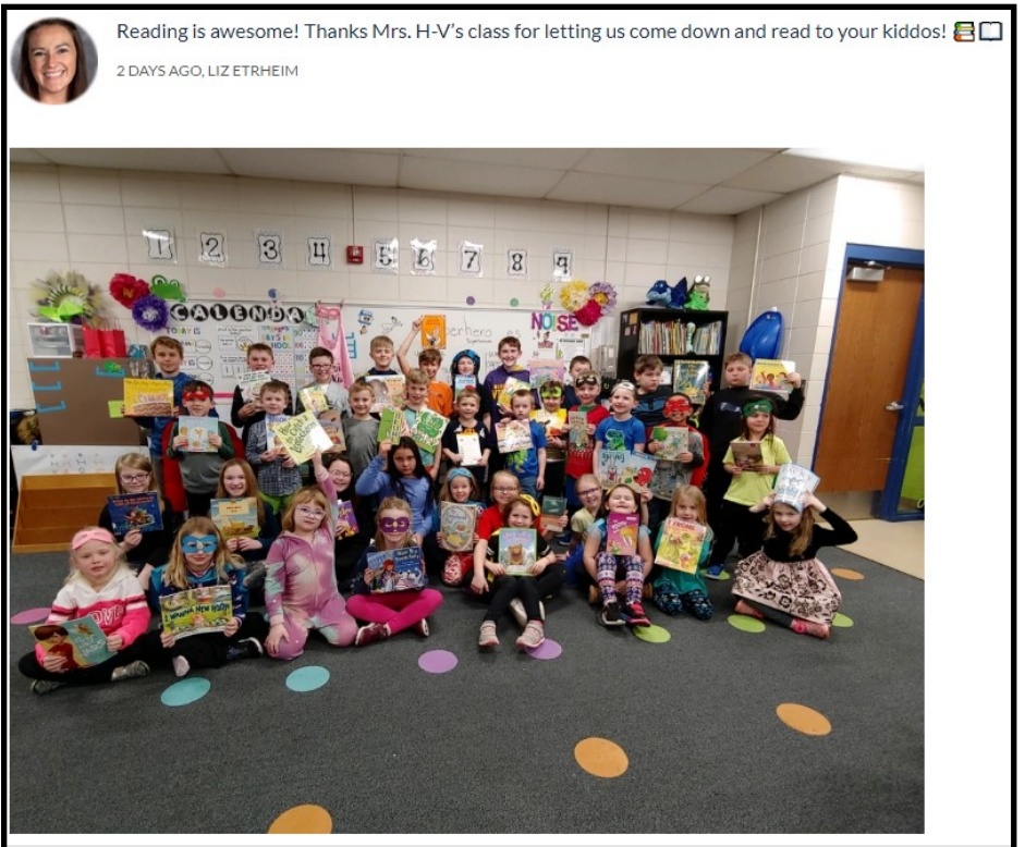
Mrs. Etrheim's fourth graders paired up with Mrs. H-V's kindergarteners to read and celebrate the week.

They celebrated with dress up days all week featuring their super powers of empathy, relationship building, connections, as well as reading and all the doors it can open for you.